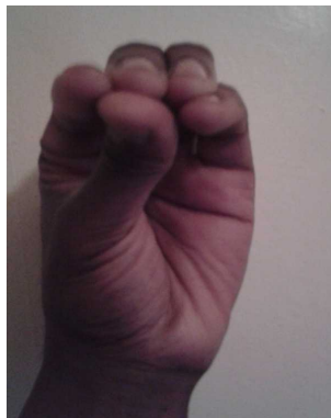
S S S S