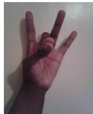
T S T T

The musician can then use the indication to create a melody. The hand only indicates the first five notes, so any arrangement can be made above the fifth note. As the hand gives no indication of vertical direction, the more creative musician does not have to play a series of ascending notes: so TSTT could either be d e f g a (diatonic in d, f, g, a, e and c) or d c d b e b f (diatonic in f, b b and e b ).