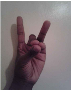
T S T S

These modes can be shown in the hand by the fingers, where a finger touching the thumb represents a semitone, while an extended finger is a tone. The performers read the hand of a director from the index finger to the little finger.